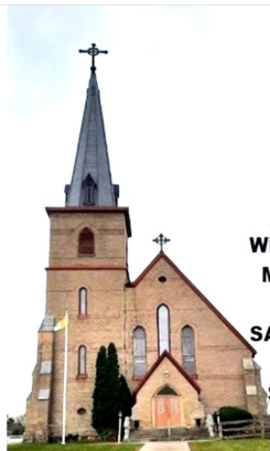
CHURCH OF ASSUMPTION OF THE BVM