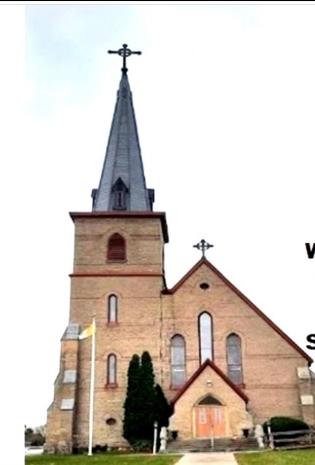
CHURCH OF ASSUMPTION OF THE BVM