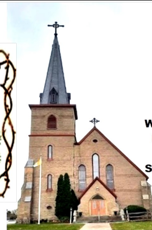
CHURCH OF ASSUMPTION OF THE BVM