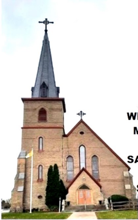
CHURCH OF ASSUMPTION OF THE BVM