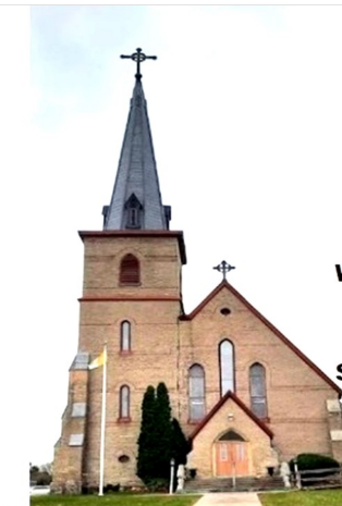
CHURCH OF ASSUMPTION OF THE BVM