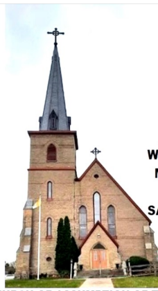
CHURCH OF ASSUMPTION OF THE BVM