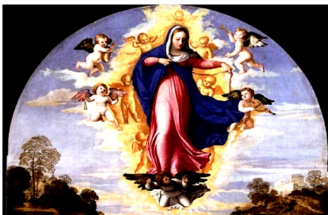
FEAST OF THE ASSUMPTION OF THE BLESSED VIRGIN MARY