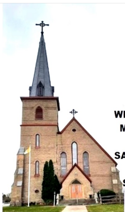
CHURCH OF ASSUMPTION OF THE BVM