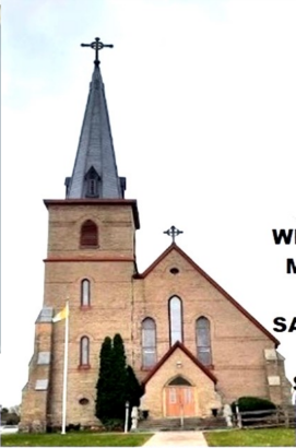
CHURCH OF ASSUMPTION OF THE BVM